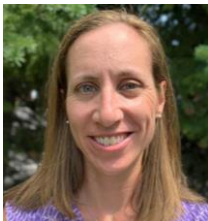
Pamela Schultz-Torosian Family Medicine